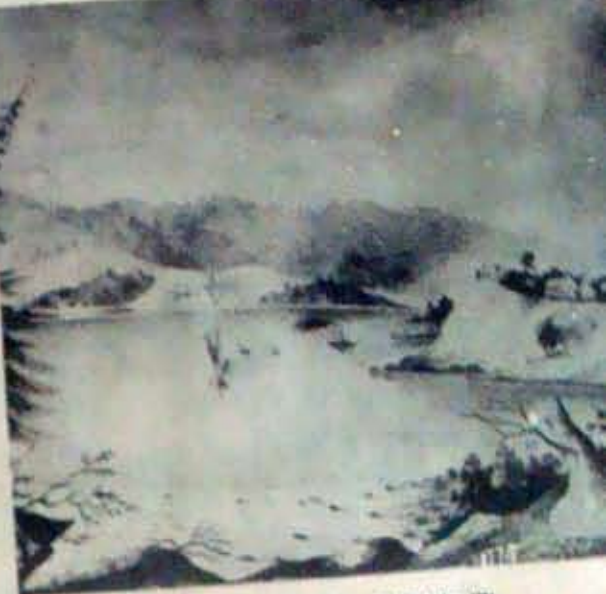
Digby in the early days. Date on picture 1774.