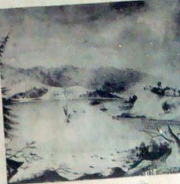
Digby in the early days. Date on picture 1924.