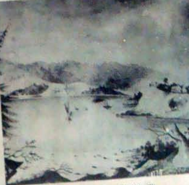
Digby in the early days. Date on picture 1924.